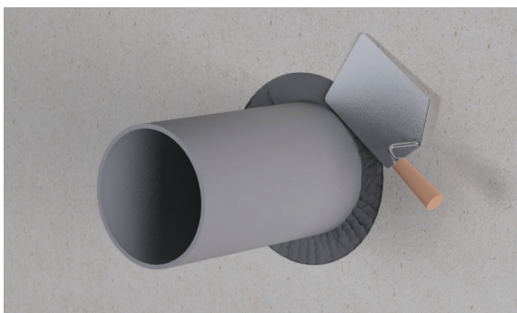
4. Smooth sealant