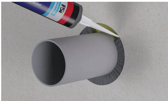
3. Applying sealant