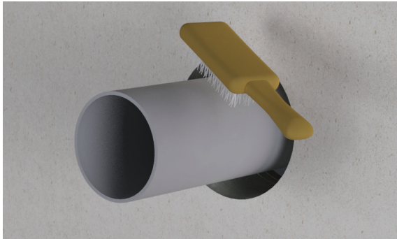
1. Clean opening