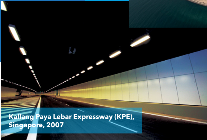
Kallang Paya Lebar Expressway (KPE), Singapore, 2007