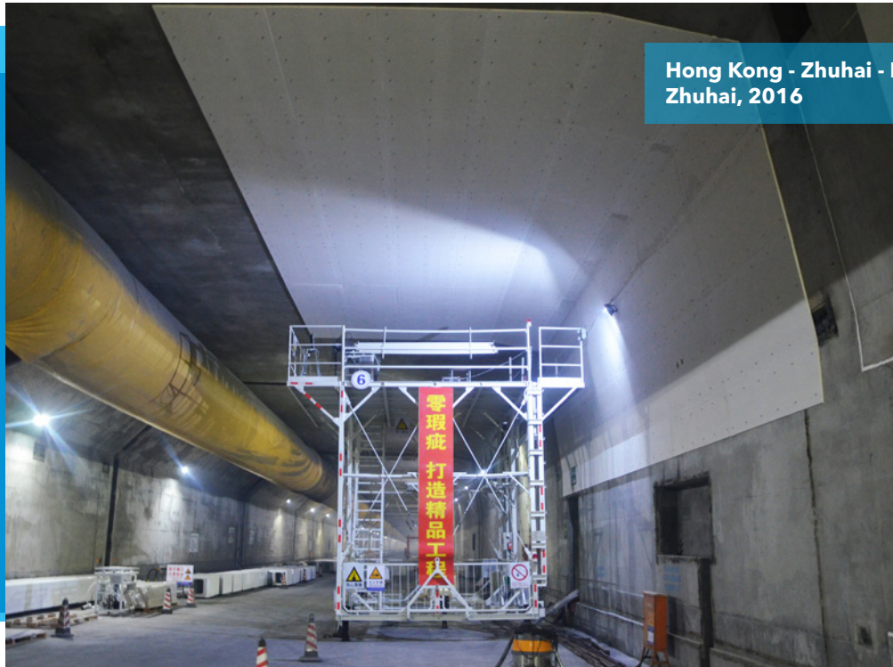
Hong Kong - Zhuhai - Macau, Zhuhai, 2016