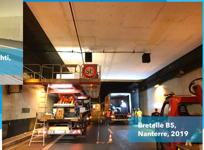
Bretelle B5, Nanterre, 2019