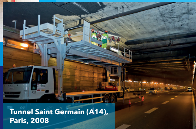
Tunnel Saint Germain (A14), Paris, 2008