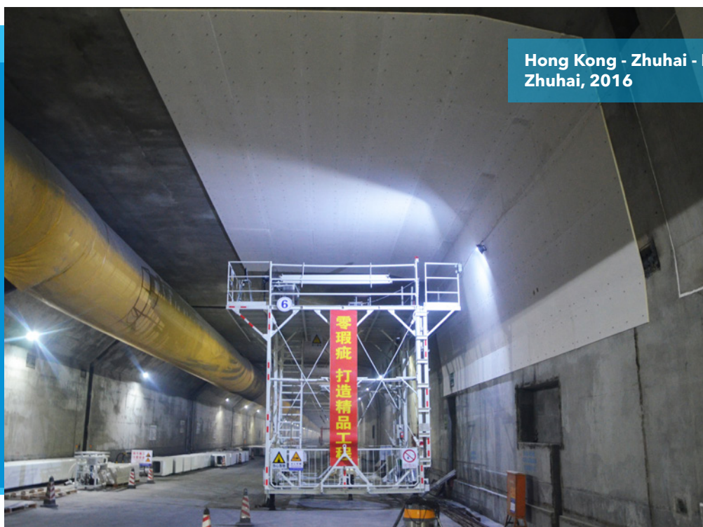
Hong Kong - Zhuhai - Macau, Zhuhai, 2016