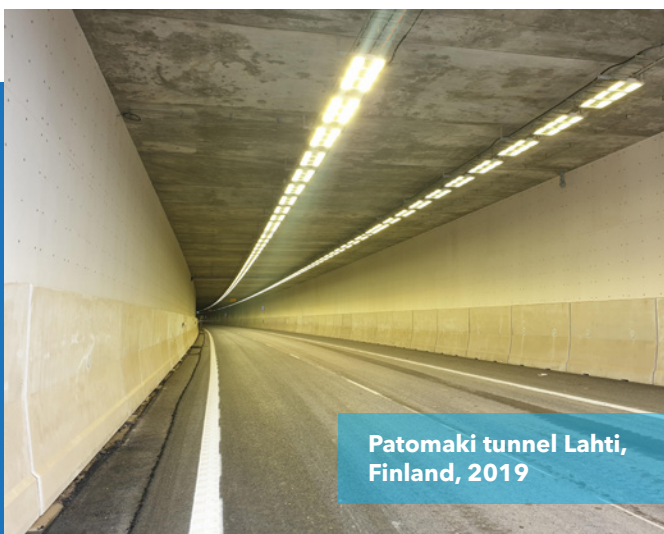
Patomäki tunnel Lahti, Finland, 2019