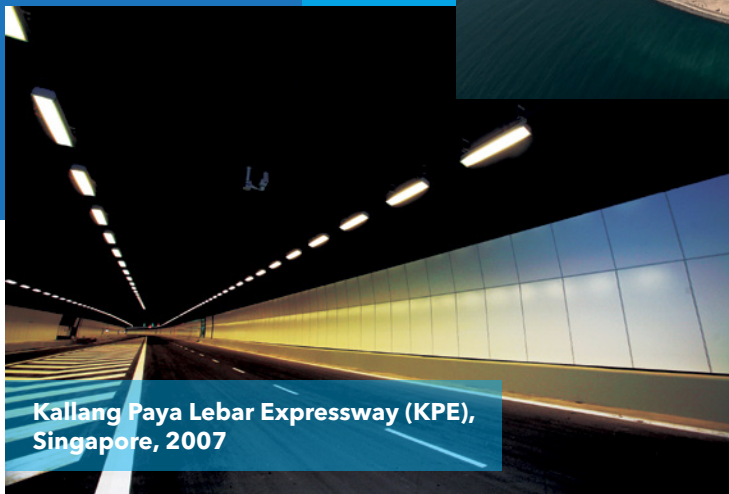
Kallang Paya Lebar Expressway (KPE), Singapore, 2007