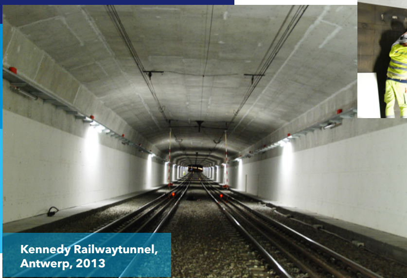
Kennedy Railwaytunnel, Antwerp, 2013