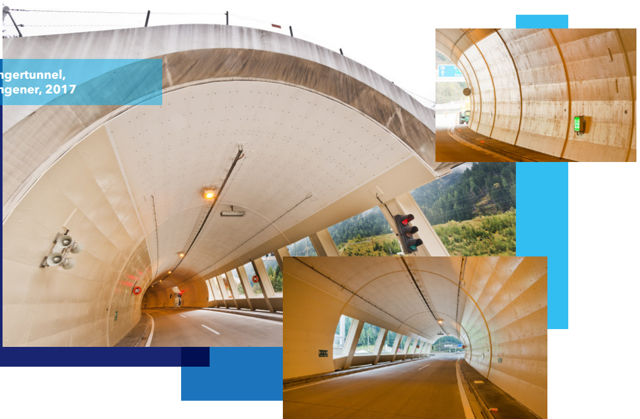
Strengertunnel, Strengener, 2017