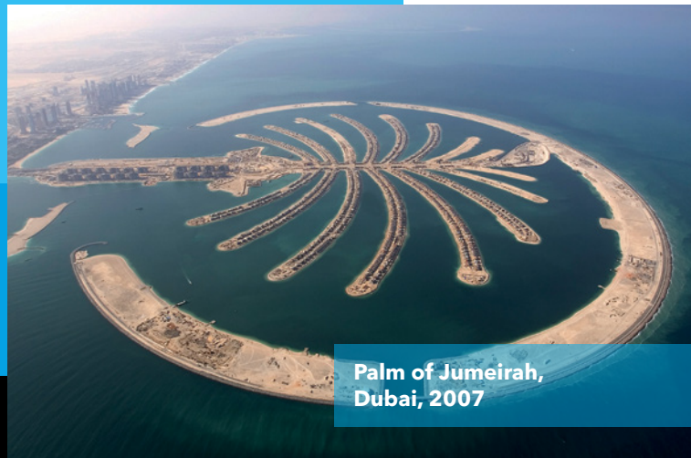
Palm of Jumeirah, Dubai, 2007