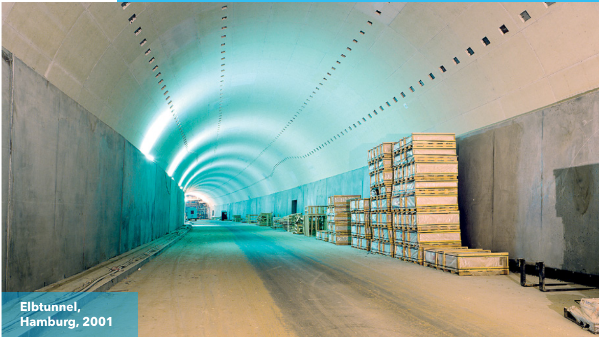
Elbtunnel, Hamburg, 2001