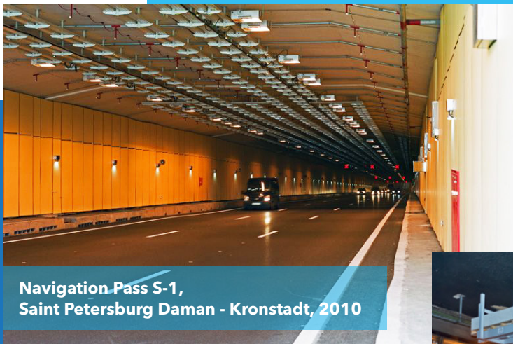
Navigation Pass S-1, Saint Petersburg Daman - Kronstadt, 2010